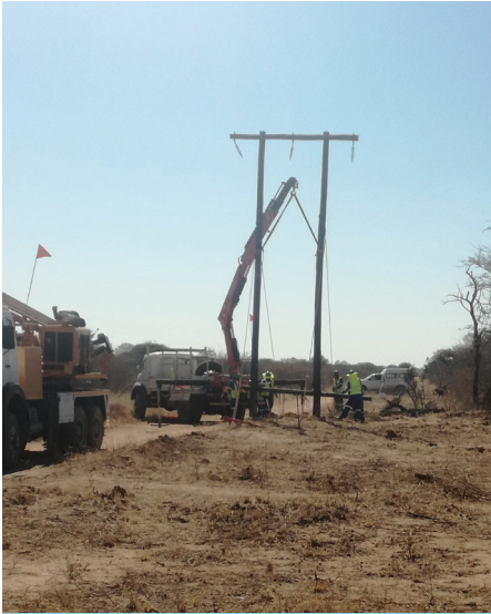
Grootgeluk Mine (Exxaro)