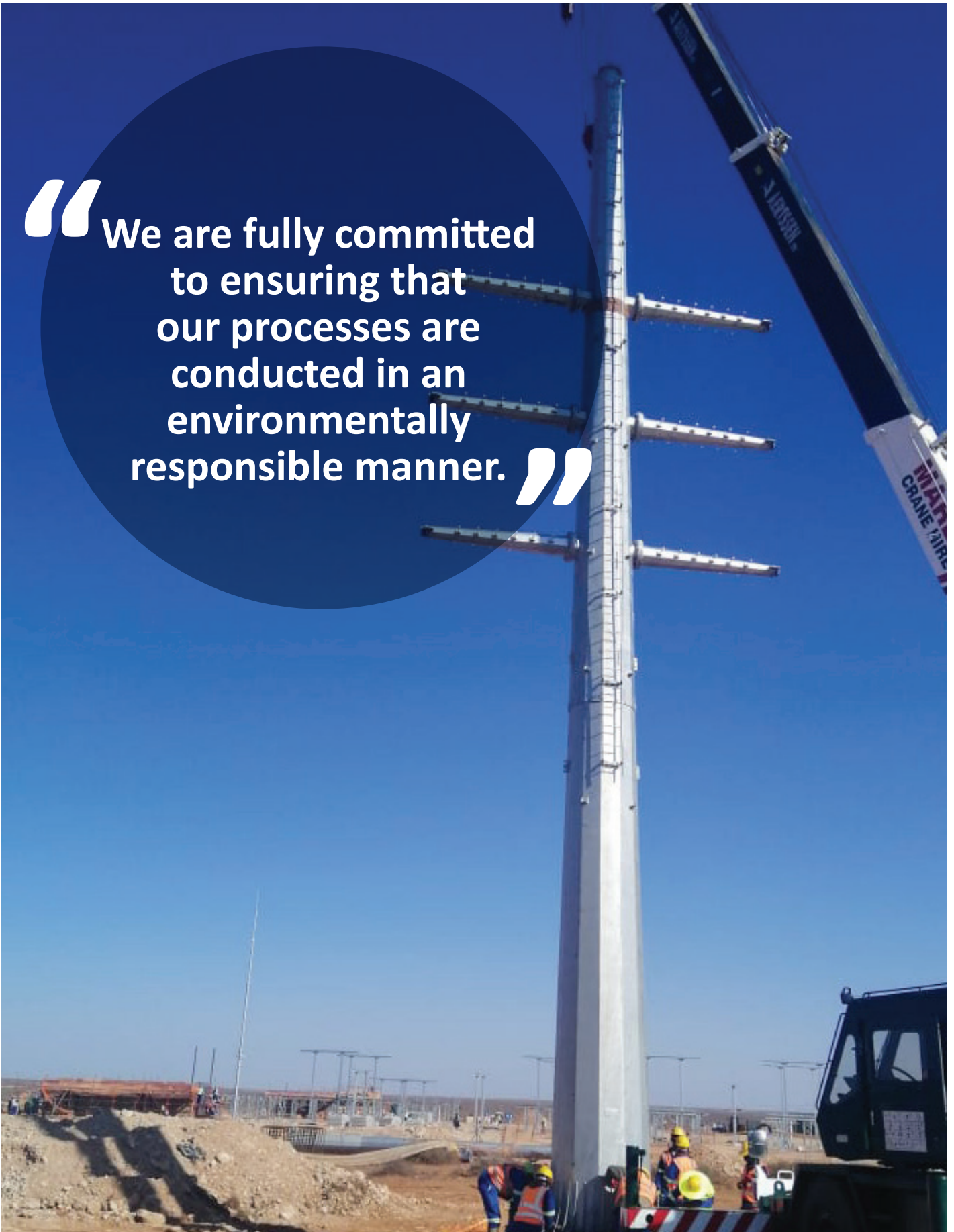
Garob Wind Farm (Enel)

“We are fully committed to ensuring that our processes are conducted in an environmentally responsible manner.”