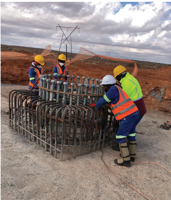
Construction of 132kV Steel monopole line