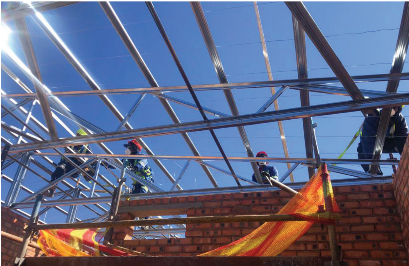
Garob substation building