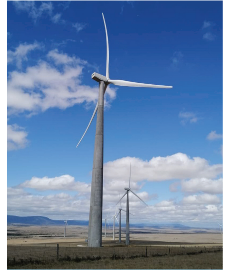
Garob Wind Farm (Enel)